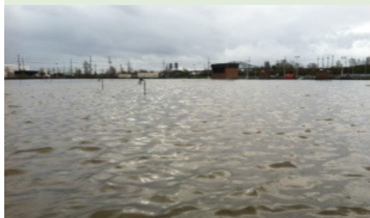
The Passaic Valley Sewerage Commission's Newark Bay Plant in the wake of Hurricane Sandy.

SUPERSTORM SANDY IN 2012 PROVED THE RESILIENCE OF DISTRIBUTED SYSTEMS. THE NEW YORK / NEW JERSEY REGION WAS HIT HARD, FLOODING AND KNOCKING OUT MANY OF THE LOW-LYING CENTRALIZED SEWAGE TREATMENT FACILITIES. BUT THE DOZENS OF ONSITE, DISTRIBUTED WASTEWATER RECYCLING SYSTEMS IN THE REGION WERE ALL BACK UP AND RUNNING ON GENERATORS 24 HOURS AFTER THE STORM.