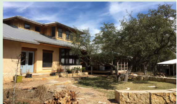
Texas Water Development Board 2018 Rain Catcher Award.